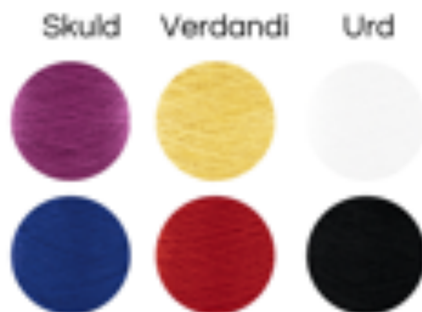
French cotton and wool yarns