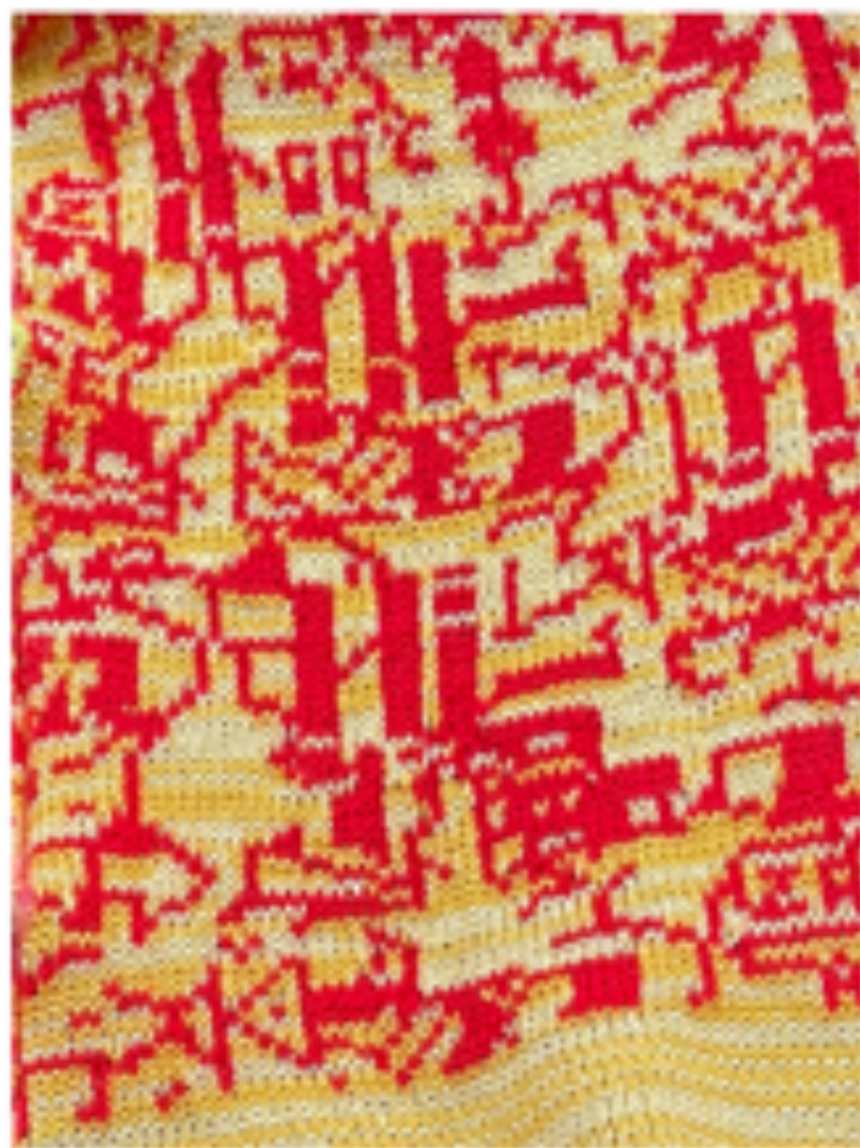
2nd Norne - The Present