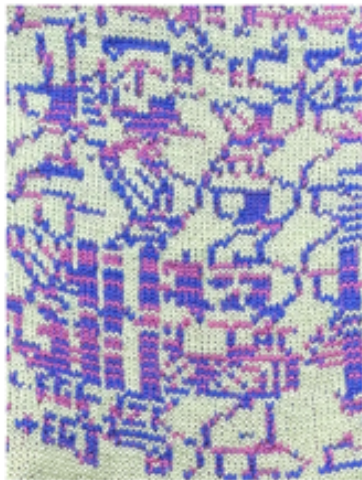
3rd Norne - The Future