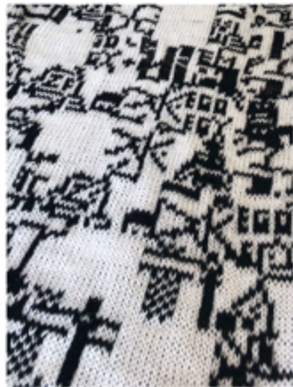
1st Norne - The Past